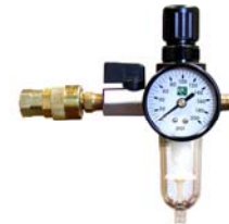
Filter, Regulator, Gauge Pkg. 1559A-ASSY