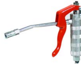
Control Handle 1536A

Complete system with all parts shown for pumping grease from 120-lb. drum