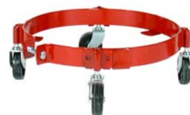
Drum Dolly 120-S