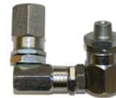
"Z" Swivel 1545